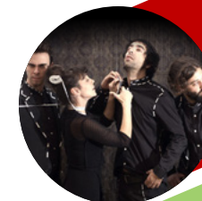
LA BROMA NEGRA